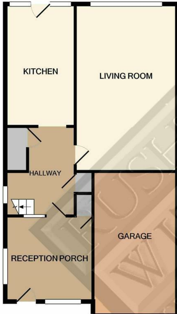
GROUND FLOOR APPROX. FLOOR AREA 604 SQ.FT. (56.1 SQ.M.)