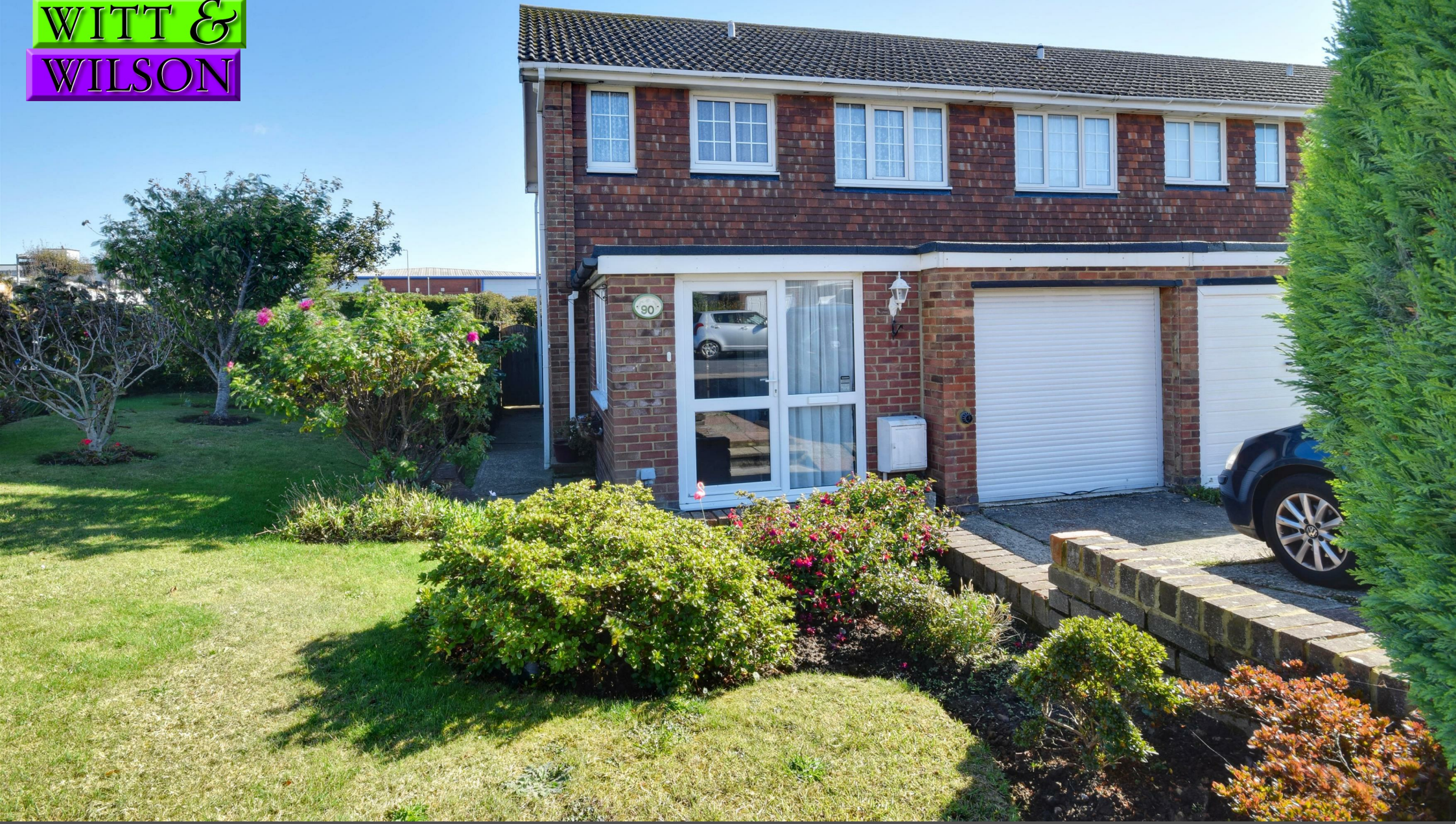
90 Ridgewood Gardens, Bexhill-On-Sea, East Sussex TN40 1TS £350,000